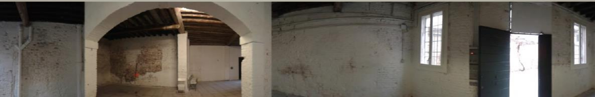
Panoramic View of Room 1 and 2