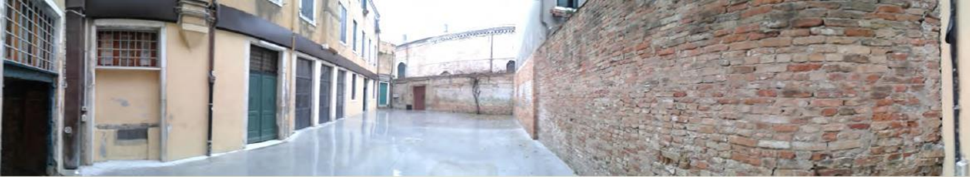
Panoramic View of Courtyard