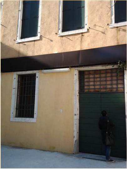
Door to Room 1 and 2