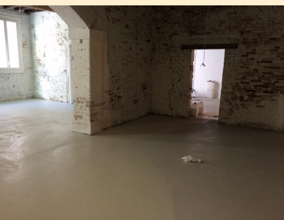
Room 3 ( with doorway to Room 6)