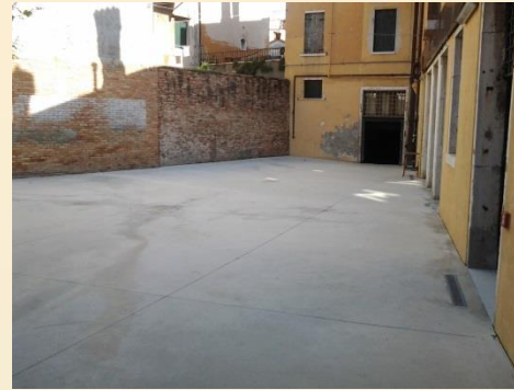
Courtyard (pathway to the canal)