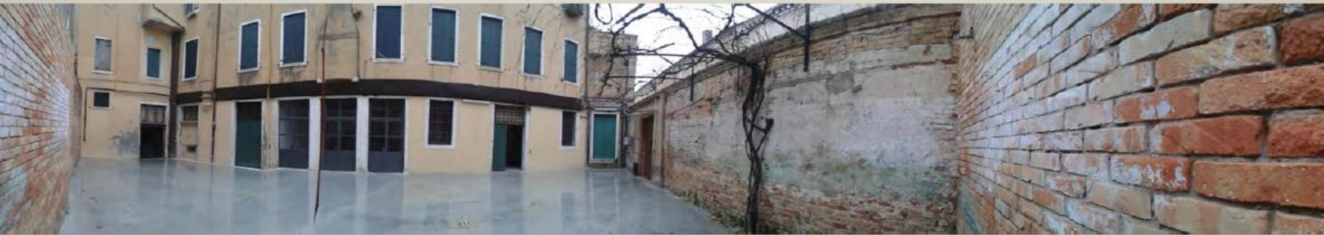
Panoramic View of Courtyard