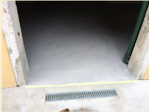
Door to Room 1 and 2 (Detailed)