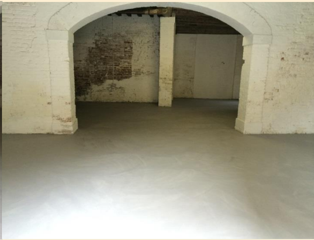
Between Room 1 and Room 2