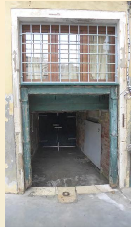
Pathway to the canal