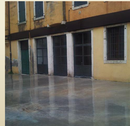
Courtyard (doors to Room 6)