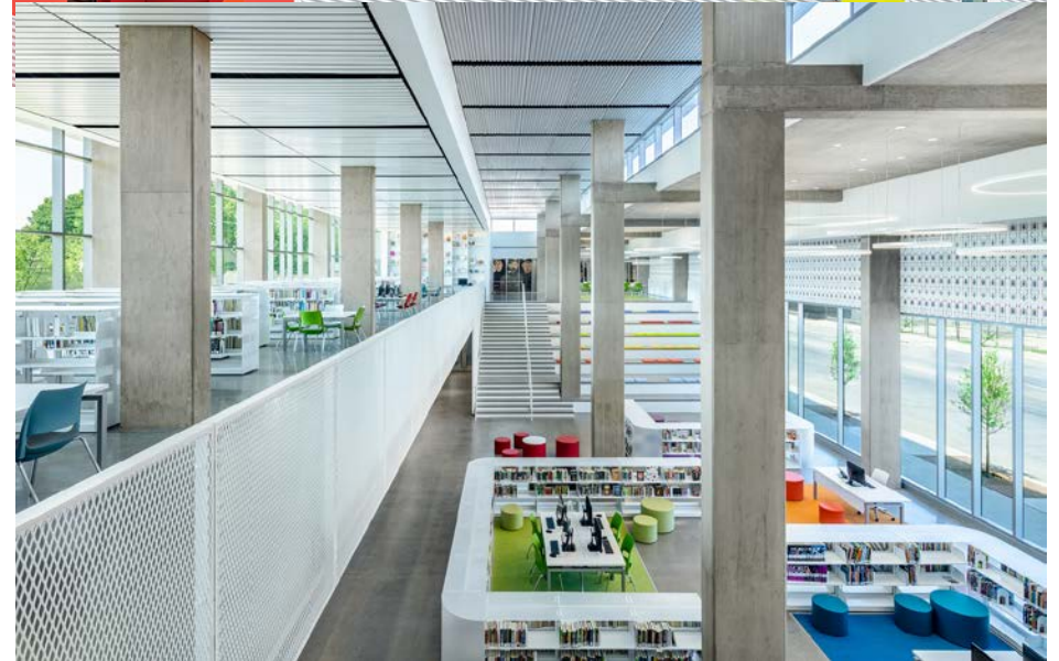
Independence Library and Apartments , Chicago by John Ronan Architects