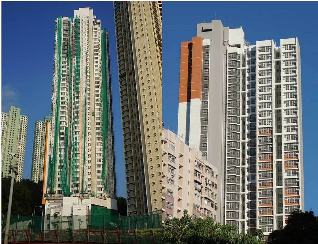
Yau Lai Estate 7 Phase, 2019

With the aid of MIC and best utilization of our limited land supply, our public housing design has adopted a unique architectural syntax of its own over the past decades: the modular repeated blocks are stacked on top of each other; the building form is a plan outline extrusion; services pipes are exposed.