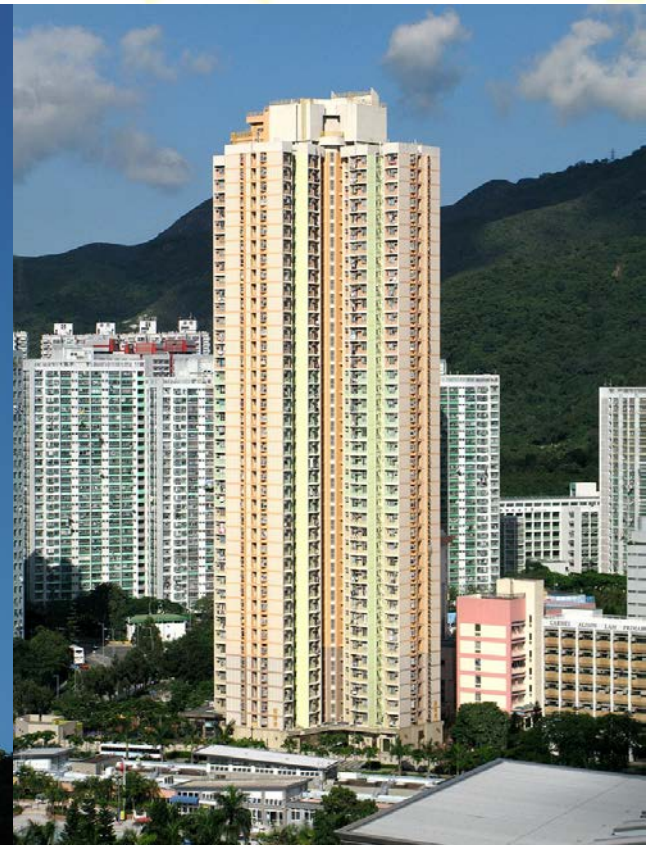
Lin Tsui Estate, 2018