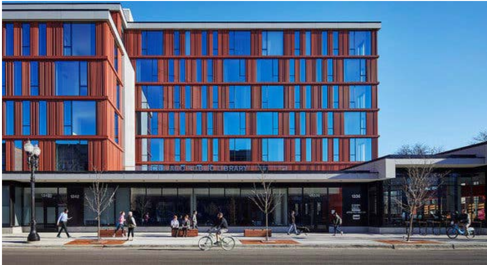
The Taylor Street Apartments and Library, Chicago by SOM