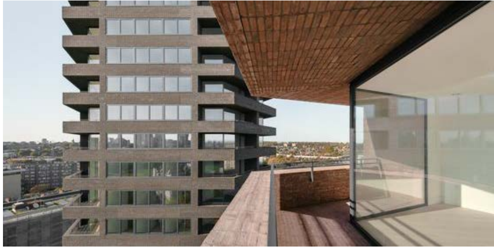
Hoxton Press, London by David Chipperfield