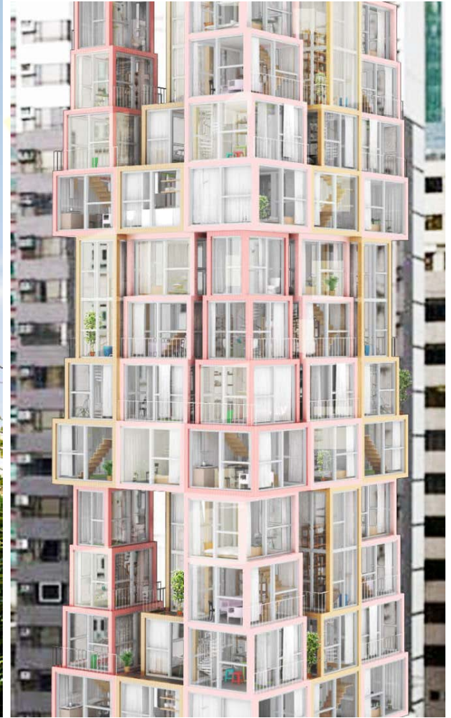
Winner of the Hong Kong Pixel Homes competition, "Towers Within a Tower"