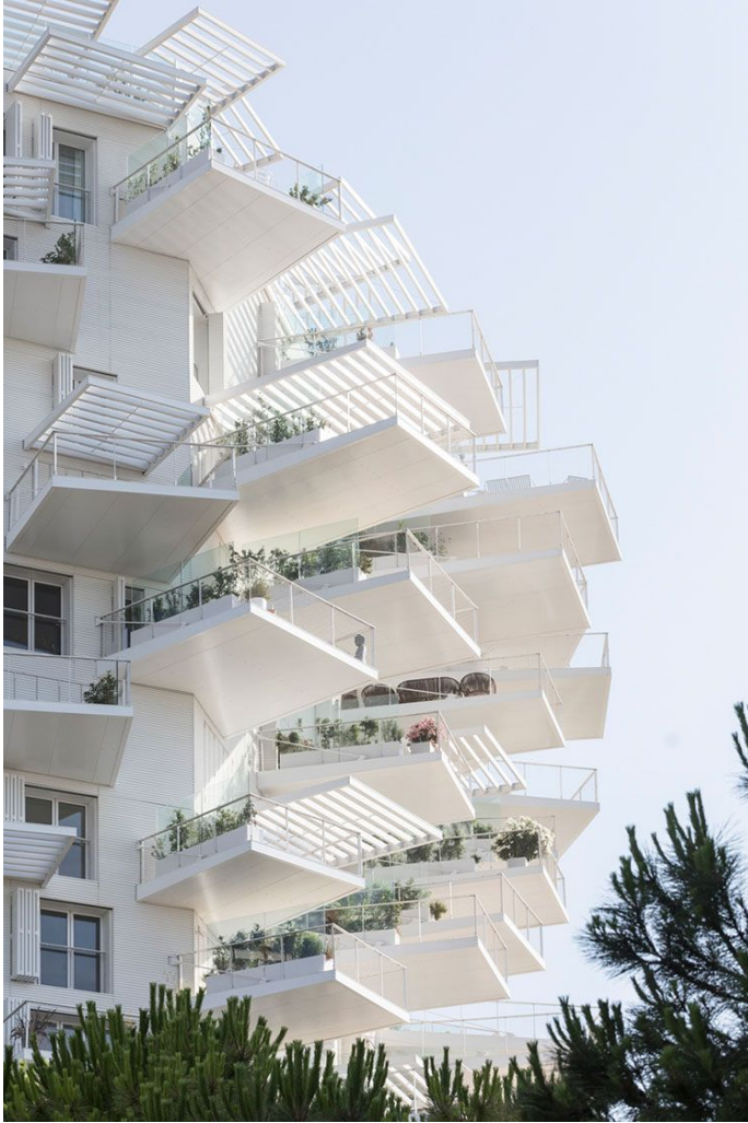
L'Arbre Blanc tower by Sou Fujimoto