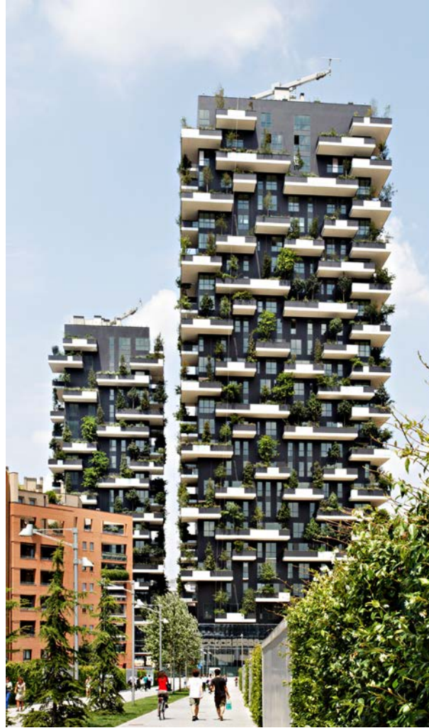
Bosco Verticale by Boeri Studio