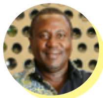
Prof. George Abungu, KENYA

Day 1 - International Bodies Round table discussions